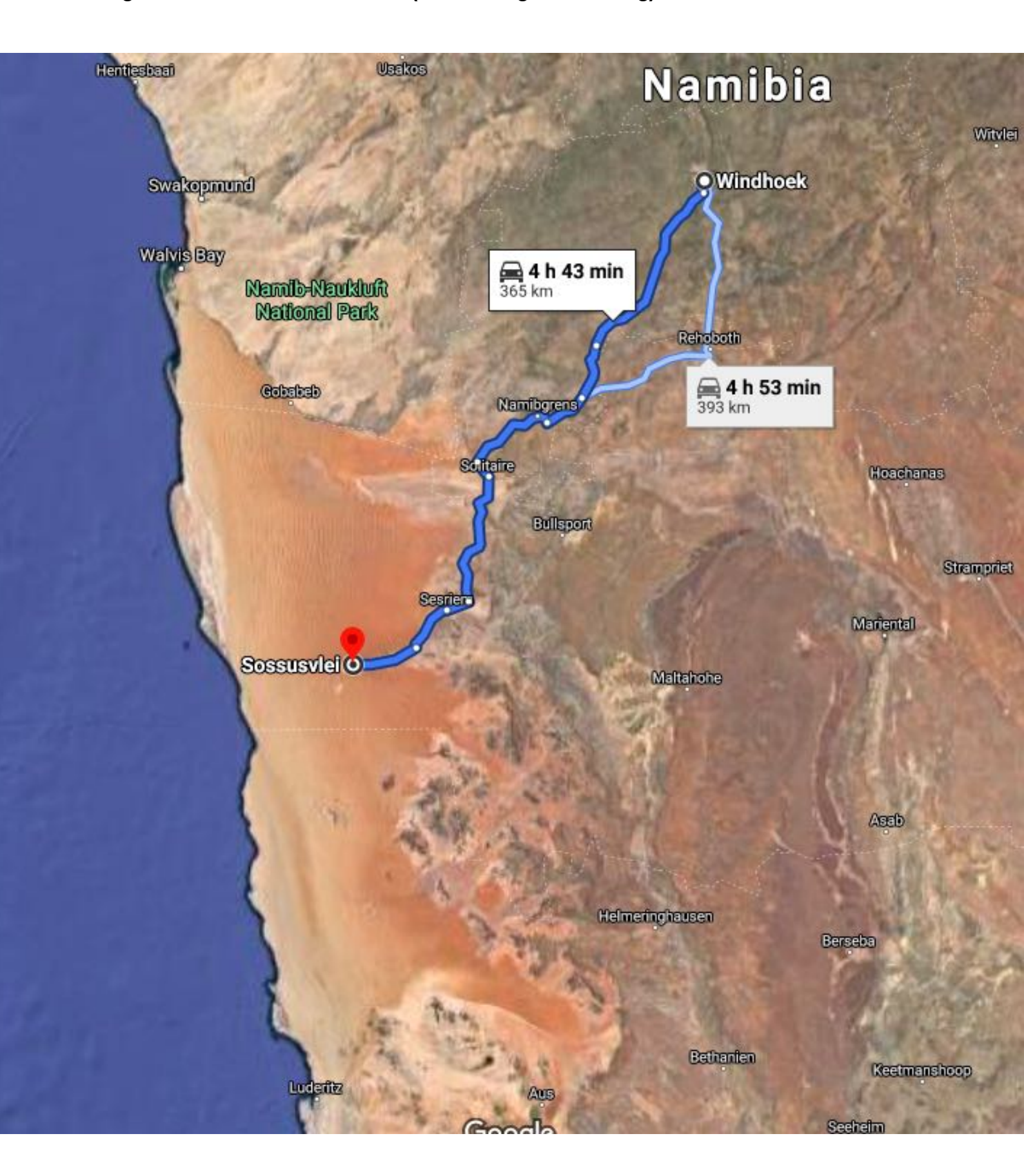
Leg 1 - Windhoek to Sossusvlei (5-6 hours gravel driving)